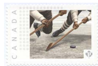
Figure 4. Invitation to the unveiling ceremony (below), and the special "Picture Postage" stamp used to mail them (right).

Thanks to Sally McMullen and Phil Legault of Canada Post for their assistance with information and illustrations for this article.