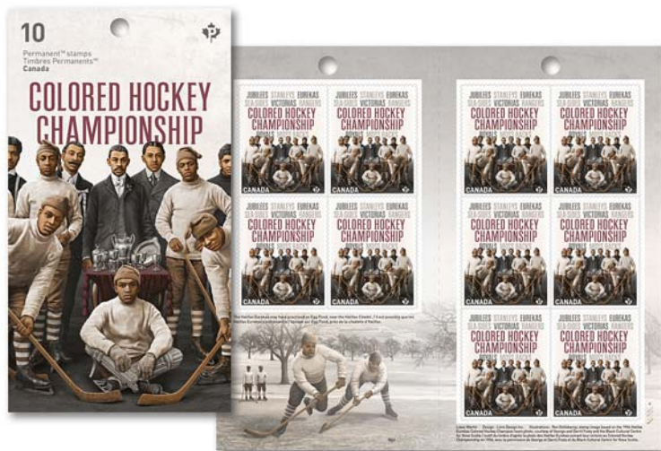
Figure 3. The booklet cover (left), and unfolded interior containing 10 stamps.

While the Coloured Hockey League of the Maritimes (CHL) was established to provide structure, there seems to have been no predetermined game schedule. Teams challenged each other to win the right to compete against the previous year's winner for the Colored Hockey Championship. According to The Canadian Encyclopedia , the "championship matches were on par with best of the white teams."