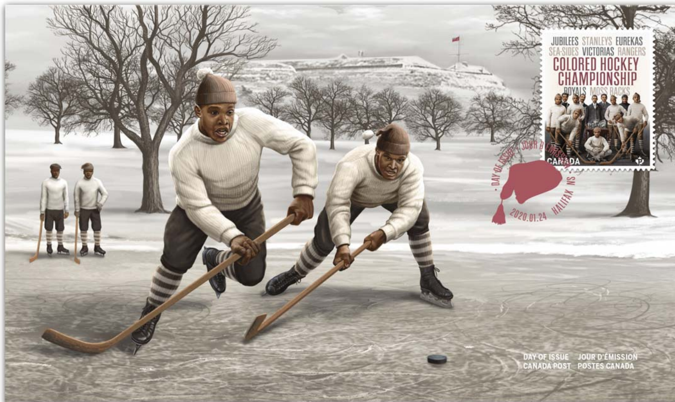
Figure 1. Official First Day Cover for the Colored Hockey Championship stamp.